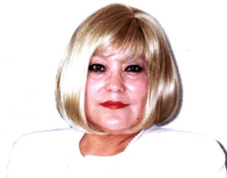
Minister Mary-Yoly Moore